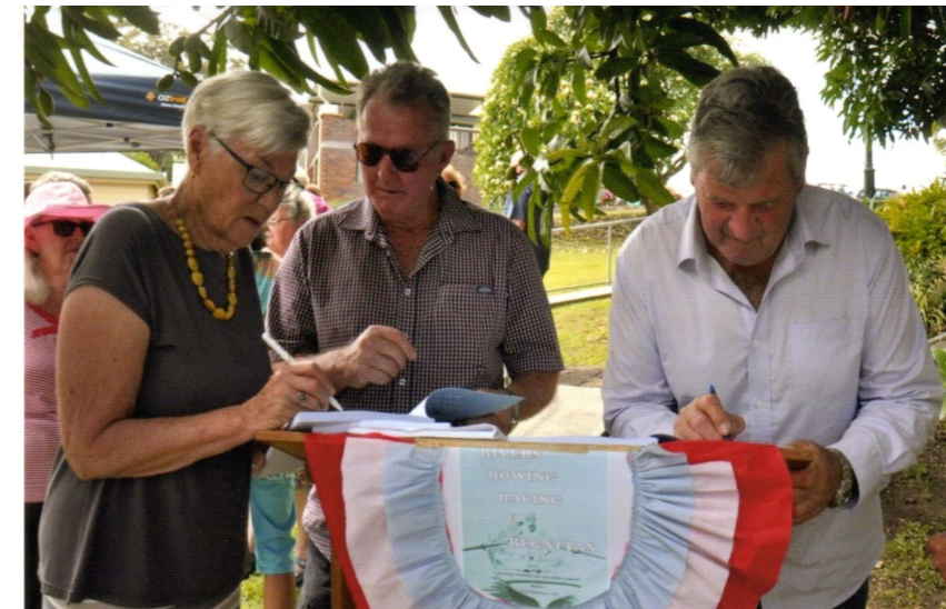
Signing copies of the book

The aim is to provide as many photographs as possible in Book 2.